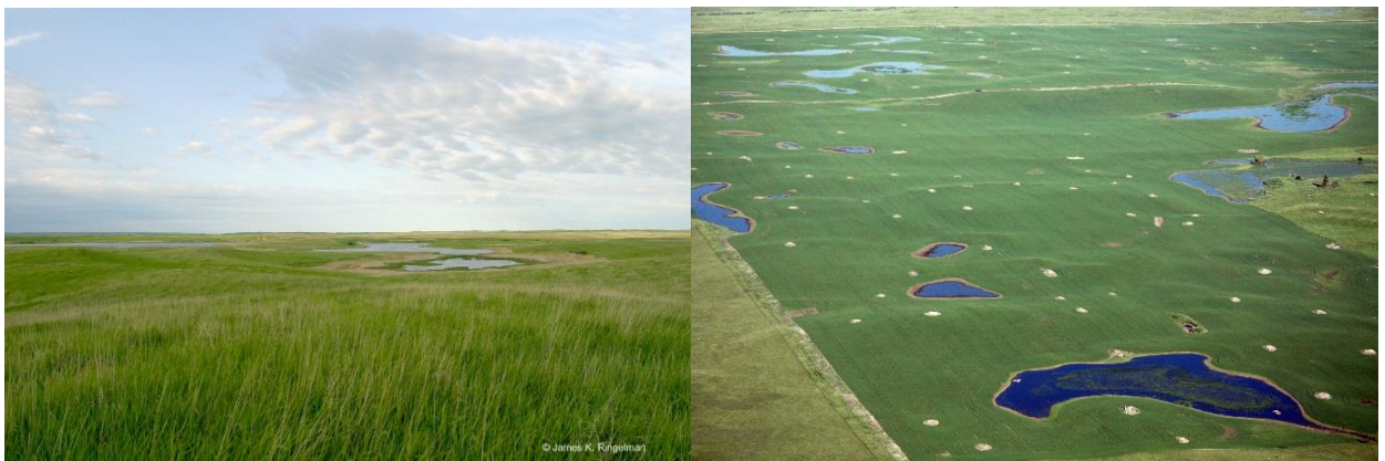
Photo (left): Native grasslands are threatened by land use change (right) Corn fields surrounding wetlands.

Direct land use change occurs when forests, grasslands or wetlands are converted to grow biofuels feedstocks. Unfortunately, high crop prices since passage of the Renewable Fuel Standard (RFS) have led to widespread conversion of previously untilled land. Although discounted by the ethanol industry, evidence of the conversion of native grasslands and other untilled lands comes from a range of sources, including USDA data showing that between 2011 and 2012, almost 400,000 of previously uncultivated lands were brought into production for the first time—much of it in states with ethanol plants, 3 remote sensing, which reveals concentrations of grassland conversions in the Western Corn Belt, 4 and farmer interviews. 5 Ecologically, it is devastating to lose what remains of our native grasslands—not to mention wetlands and forests. Less than two percent of tallgrass prairies remain. These remaining prairies should be saved for the biodiversity, history, and beauty they contain—and for the wildlife habitat, carbon sequestration, and water quality they provide. Further, when converted to croplands, grasslands, wetlands, and forests release significant amounts of carbon, reducing or nullifying a biofuel's GHG advantages.